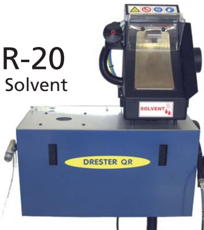
QR-20 for Solvent