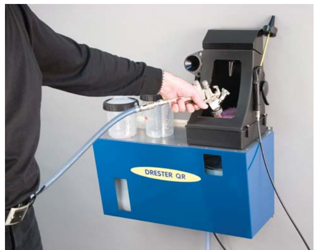
2. Clean the air cap