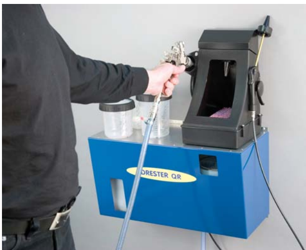
3. Spray out the remains