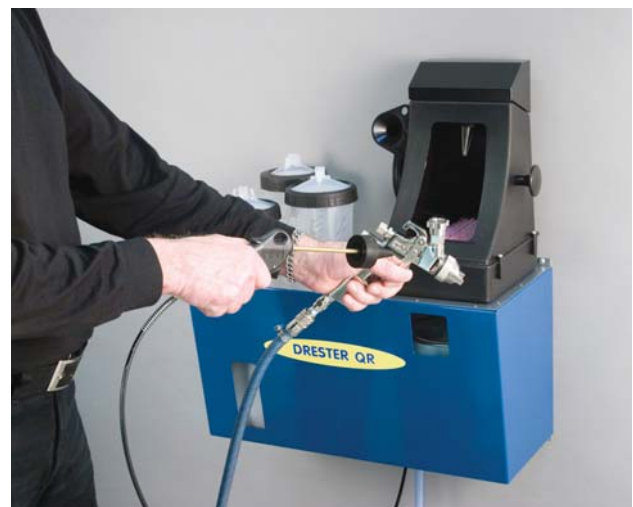
4. Dry the gun