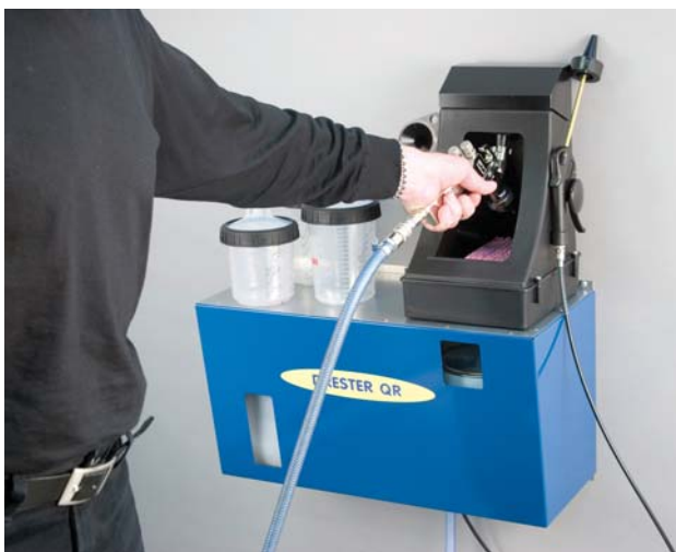
1. Rinse the paint channel